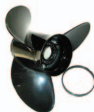
Vortex XHS Aluminum Propeller