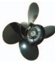
Vortex XHS Aluminum 4-Blade Propeller