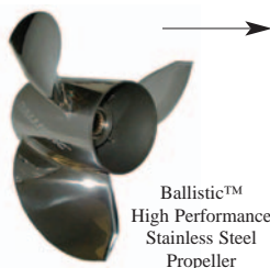
Ballistic™ High Performance Stainless Steel Propeller